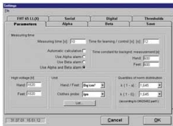
The "FHT65" tab